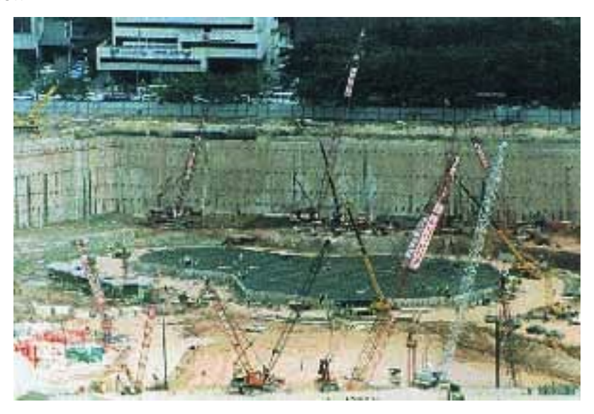
The foundation took one whole year to complete; every step of its construction was a technological breakthrough.

The Twin Towers were planned to be built on the site of the former Selangor Turf Club which was flat, green land. But soil studies showed that the site where the buildings were originally planned for, proved unsuitable for the foundation due to the irregularities of the limestone bedrock below that's known as Kenny Hill soil.